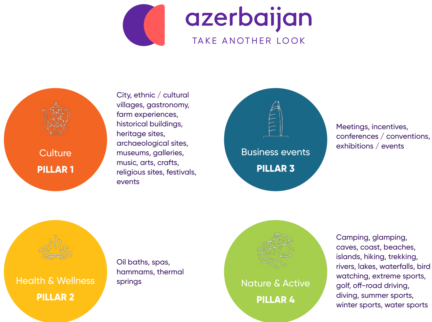
Figure 1. Azerbaijan destination brand product lines